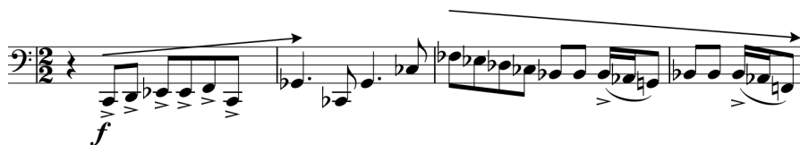
Example 10: Tuba Sonata, mm. 31-34.

The melodic motive in the accompaniment of the first measure focuses on stacked fourths, articulated in [027] trichords. This reappears throughout the movement accompanying the