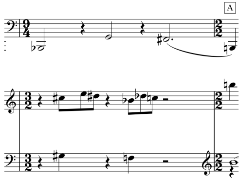
Example 3 : Tuba Sonata, mm. 9-10.

The V-I melodic framework is not supported harmonically by the accompaniment in m. 9, which is a sequence of descending [013] triplets articulated on the upbeats. However, the B on the downbeat of m.10 is supported by octave B's in the accompaniment, in close proximity to F-sharp and D-sharp. This harmonic support combined with rhythmic insistence resets the listener's pitch memory, and the V-I melodic motion becomes a transition to B, the central pitch of the following theme.