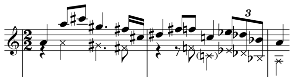
Example 9 : Tuba Sonata, mm. 28-30, lower stems show octatonic outline.