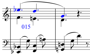
Example 7 : Bassoon Sonata, mm. 18-19.

The melodic design of the solo line, rearranged in a single octave, resembles a Bb natural minor scale missing its primary “minor” characteristic: the D-flat (Example 8). Throughout the movement, many phrases develop and expand this scalar structure. For example, see the descending altered octatonic scale—this could also be considered B-flat minor with raised and lowered sevenths—starting and ending on A in mm. 28-29 (Example 9), or the scalar segments that characterize both halves of the main development melody in mm. 54-57 (Example 10). Like the bassoon sonata, both these excerpts happen at structural markers: the beginning of the subordinate theme and the core of the development.