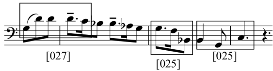
Example 5: Bassoon Sonata, mm. 20-22.

begins with an ascending fifth and unaccented whole-step, gradually developing the [027] motive into [025] through diminution and dotted rhythms (Example 5).