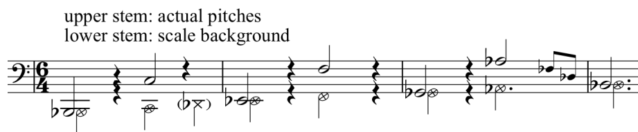
Example 6 : Tuba Sonata, mm. 1-4.

The opening four measures of the tuba sonata also have thematic implications for the rest of the sonata. The melodic design of the solo line, rearranged in a single octave, resembles a B-flat natural minor scale missing its primary “minor” characteristic: the D-flat (Example 6). Throughout the movement, many phrases develop and expand this scalar structure. For example, see the descending altered octatonic scale starting and ending on A in mm. 28-29 (Example 7).