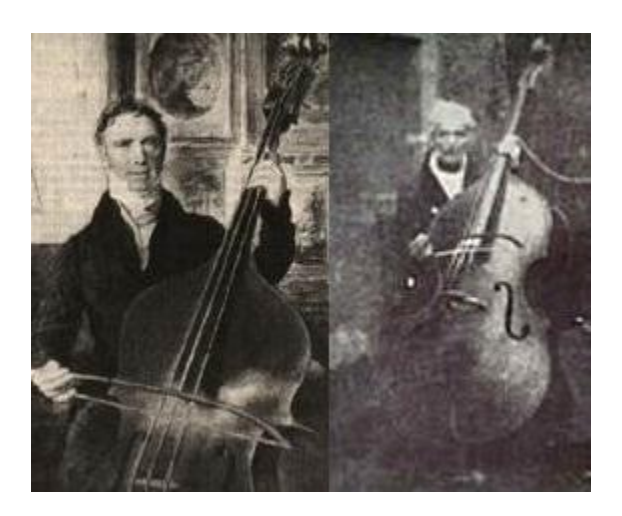
Figure 1.1 - Painting and photograph of Domenico Dragonetti

a long time<sup>29</sup> as seen in the three-string double bass tuned A-d-g and the use of the "Dragonetti bow." This bow was the basis of what would become popularly known today as "German bow." Sometimes described as an underhand bow, a more precise definition of this holding can be endways or saw-like. This definition also helps in differentiating it from the viola bow style, which is truly an underhand bow. However, both Dragonetti's and the viol-bow featured a common characteristic, the players' fingers on the hair sometimes tightening it or losing it to achieve different tensions. As to his pedagogical output, Dragonetti only left some studies<sup>30</sup> and perhaps a lost method.<sup>31</sup>