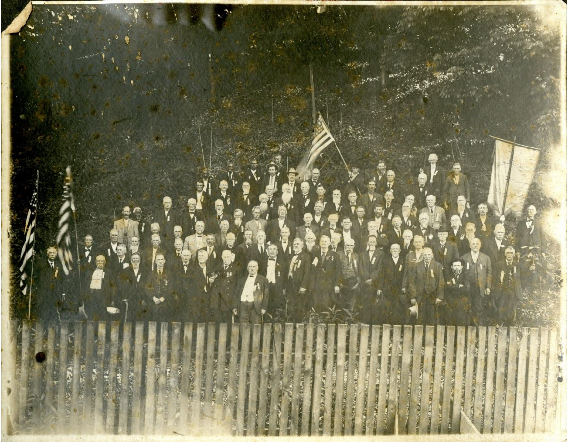
Figure 1: East Tennessee GAR members gather for a picture at a state encampment. While the white members are in the foreground, five black members are along the periphery of the group. Four black veterans are in the very back row and another stands along the left edge of the group. Grand Army of the Republic Photograph, undated, in William Henley Nelson Family Papers, Series IV, box 5.