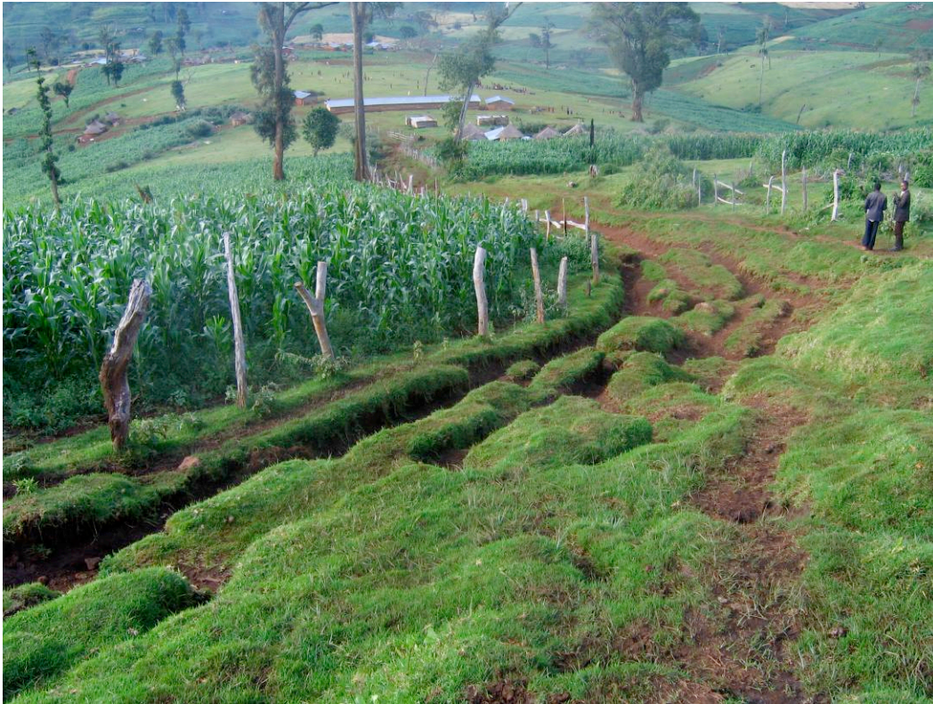
Figure 4.7 A road in Mengya (above the 1993 line), impassable by vehicle.