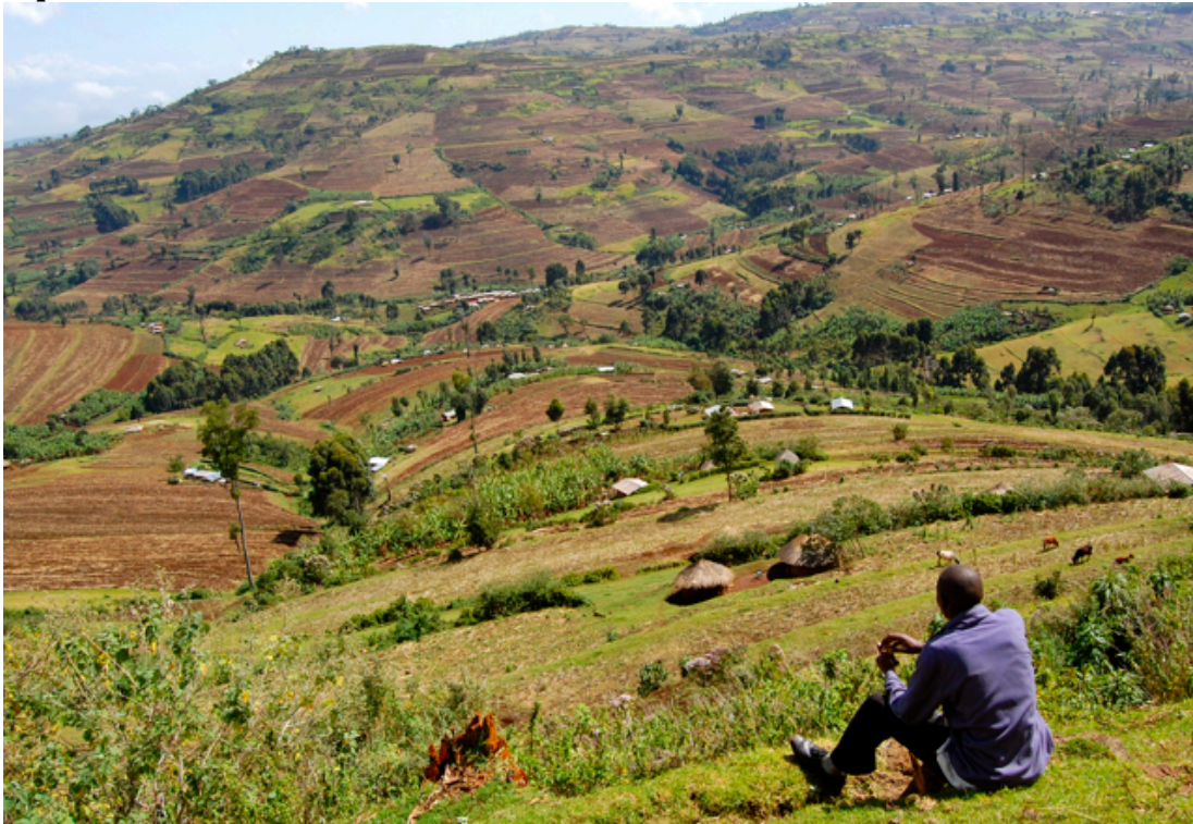
Figure 3.2 The individualized farmsteads of the Benet Resettlement Area.