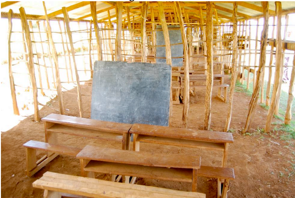
Figure 4.6 Parent-funded community school in the temporary settlement of Kisito. More than 200 children attend the four-room school.