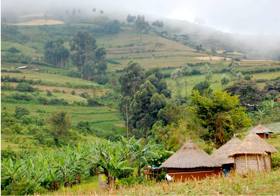
Figure 4.3 A homestead below the 1993 line. Note the banana plantation, eucalyptus woodlot, and anti-erosion bunds.