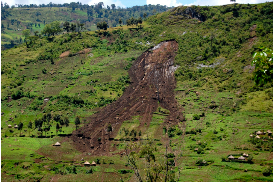
Figure 3.5 A landslide in the Benet Resettlement Area. Fields were destroyed but no one was injured. Residents report that landslides such as this have become increasingly common.