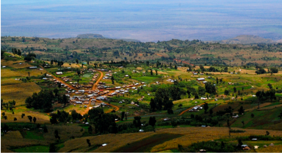
Figure 3.3 An aerial view of Kapnarkut, a rapidly growing trading center with the plains in the background.