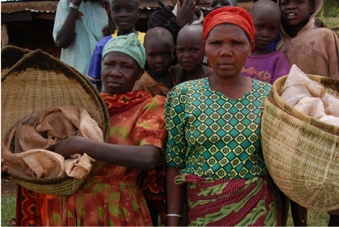
Figure 3.1 Women originally from the uplands on a bamboo basket trading expedition.