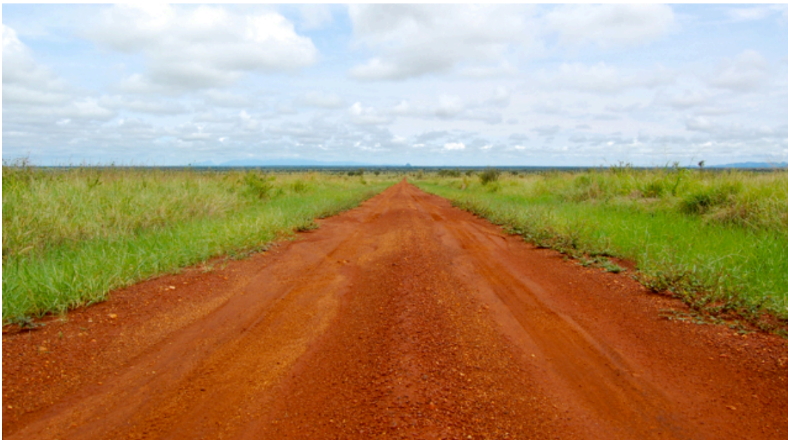
Figure 3.4 The lone road that runs through the Ngenge plains, taken at the start of the rainy season.