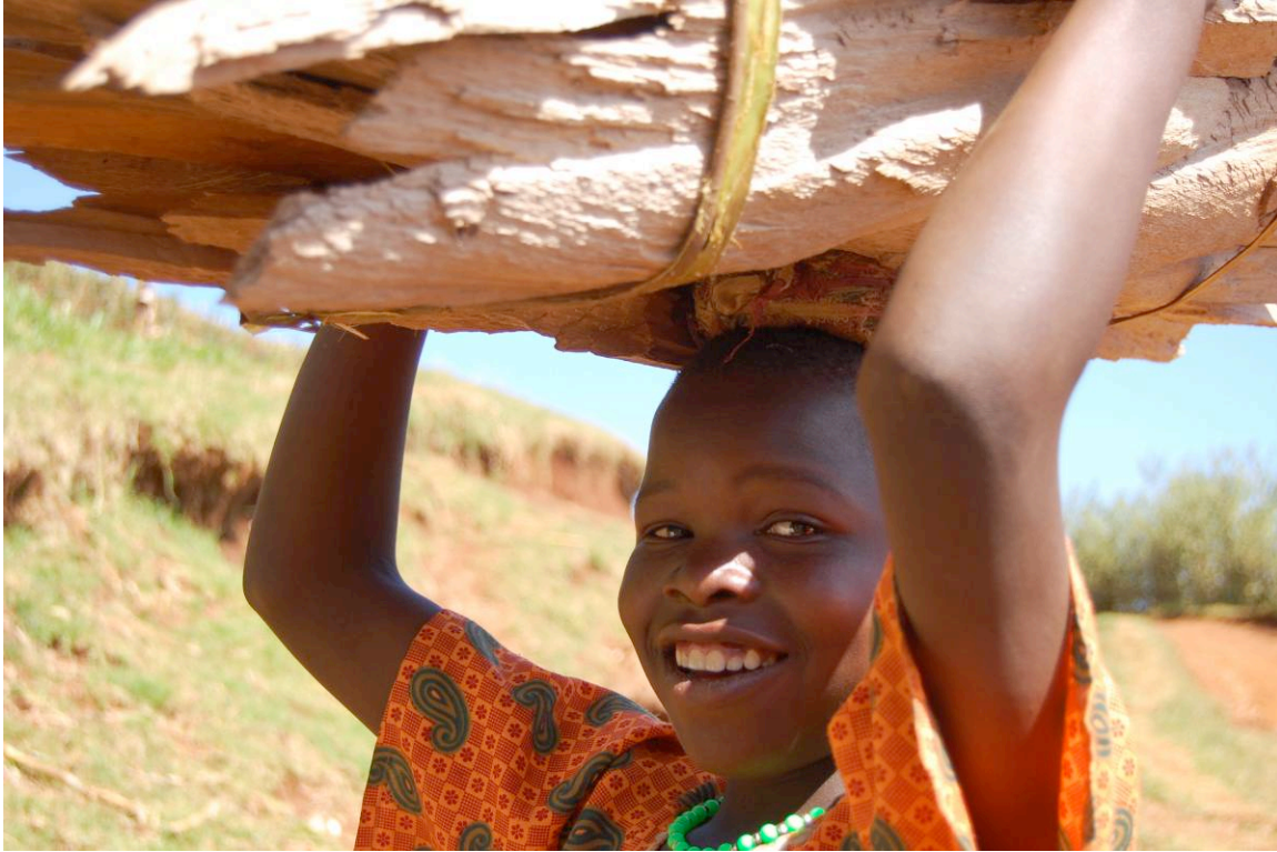
Figure 4.5 A girl from above the 1993 line selling firewood. Her parents collected the wood from the national park in the lower part of the resettlement area. Adults frequently send their children to sell forest products because children receive reduced fines from UWA rangers than adults.