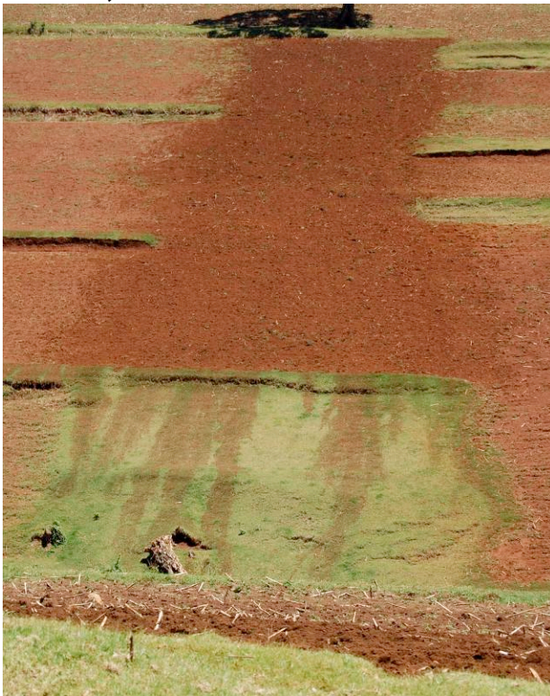
Figure 4.4 Sheet erosion above the 1993 line.