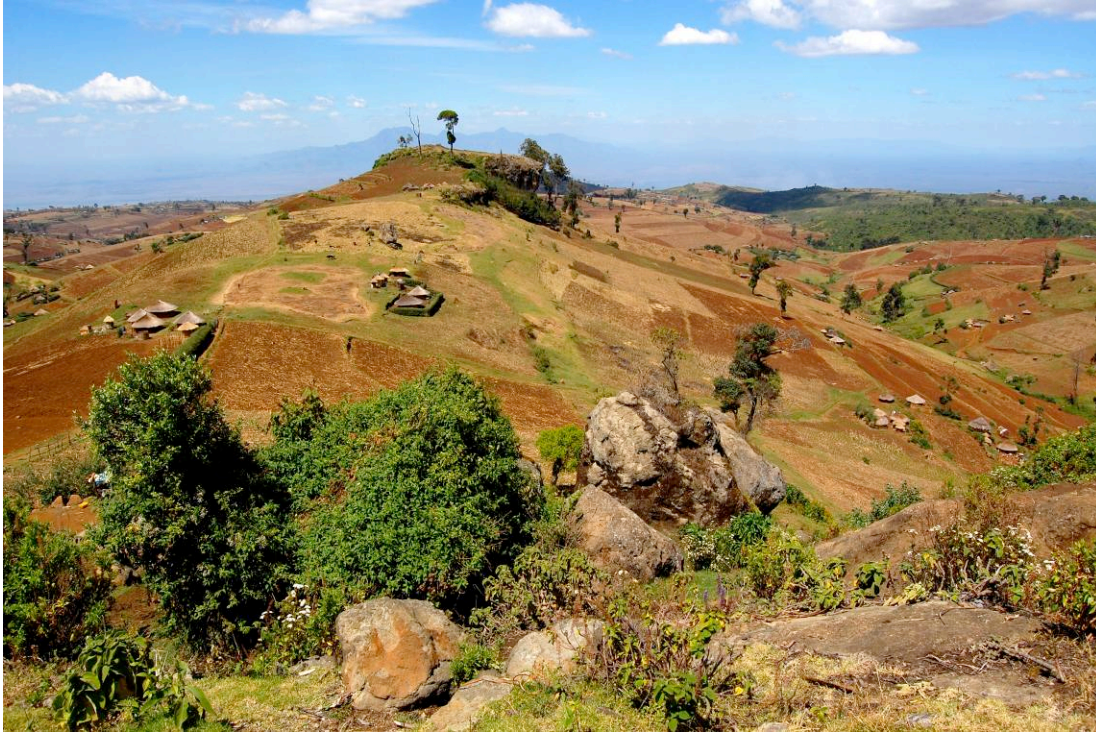
Figure 4.2 A view from Kisito looking north down into the contested zone. The 1993 line runs behind the promontory in the background. Note that there are few trees planted (the trees pictured are remnants from the forest) and few long-term investments.